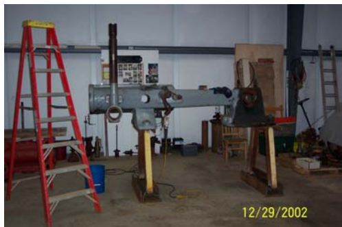
Corliss frame and governor column

Along with the fully restored and operational historic sawmill (circa 1890's) powered by a 1910 60 hp Case steam traction engine, we will display some of the 60 hp Corliss steam engine parts that are being restored at Bill's machine shop.