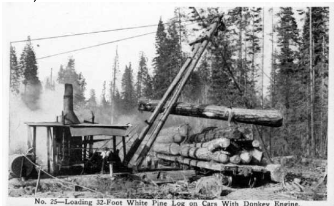
No. 25—Loading 32-Foot White Pine Log on Cars With Donkey Engine. A Steam Donkey loading a rail car.

weighs 10-12 tons and is 12 feet high. After cleaning them up we will mount them on skids and connect one up to the Corliss to power the mill for start up at the 2005 fair. Bill has been contacting crewmembers for the work parties. If you have not been contacted and want to help, give Bill a hoot (phone).