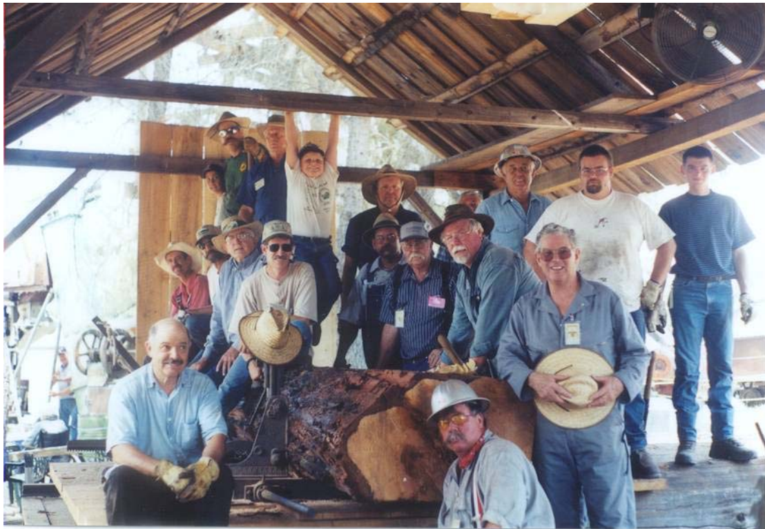
2003 Sawmill Crew (partial) This issue is dedicated to the Bullhackers, Cat Skinners, & Timber Beasts of the past.