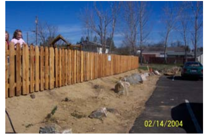
Plymouth Park Playground

DOUG FIR CUT: 18 Douglas fir logs donated by Wetzel Oviatt Lumber Co. were cut and sent to the Historic Kennedy Mine in Jackson. The lumber will be used to restore the water tower at the mine site in Jackson, CA. See their web site at www.kennedymine.com