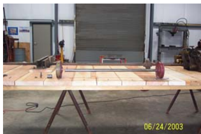
Carriage receiving new wheels, axles & deck in 2003

B. Make further repairs to the sawmill carriage to improve the alignment of the carriage so that we cut straight lumber instead of wedges.