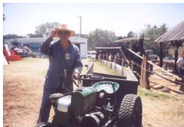
Me & the Gibson