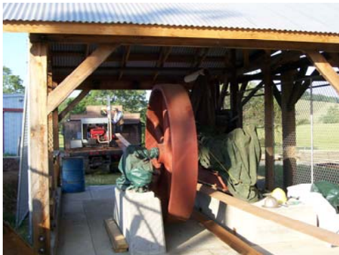
Drive belt under steam engine