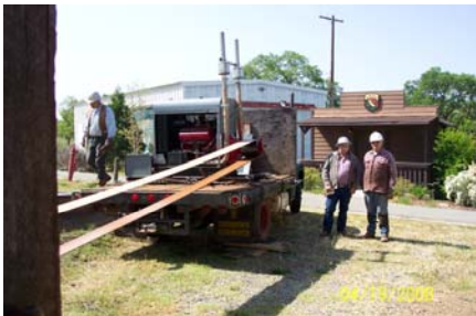
1954 Chrysler and 100' drive belt