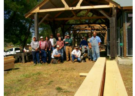
Sawmill crew group photo