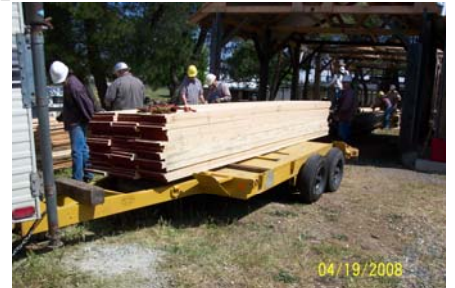
65 one by twelve's being chained down