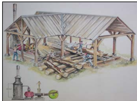
Watercolor of our sawmill