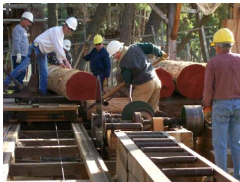
Turning the logs