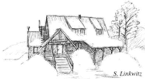
Alpine Club Lodge at Lake Tahoe

The Alpine Club of California, founded in 1913, purchased 1000 board feet of 1X12X16' of Ponderosa Pine then stacked it on a trailer and drove the load to the club's historic lodge near Echo Summit. The all wood lodge was built in 1920 as a road house to service the newly macadamized toll road over Echo Pass near Lake Tahoe, the old Meyers grade. Cars and trucks would stop and take in the superb view of the Lake Tahoe basin from 7365 feet. The club bought the lodge in 1952 and has been maintaining the lodge to Forest Service historic guide lines. This means circular saw marks on all sides of replacement wood and of the same species. They unloaded and stacked the load of 65 planks inside the lodge with lots of stickers for air drying the same day it was cut. They will have a work party at the lodge this spring so look up www.calalpineclub.org to get more information about their charming and picturesque Alpine Club Lodges and a list of activities and conservation projects they do. Our crew of 5 volunteers set up the mill on Friday connecting the 1954 Dodge HEMI Industrial Gas Engine by threading the belt under the 1904 Corliss steam engine to the main drive shaft. On Saturday the regular crew showed up and after a safety meeting by President Bill Braun and ran the mill with no brake downs. We finished the cut order by 3:30 and started to cut the re-saw pile looking for sizes we could use to finish the new mill roof. John tower loaded up all the sawdust for his horses.