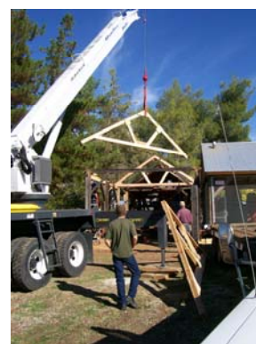
Setting roof trusses