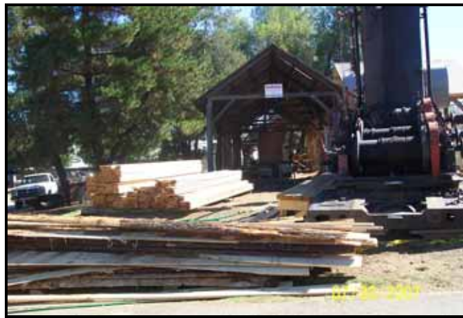
Big pile of lumber at day's end.