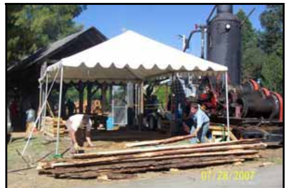
Flywheel belted and ready to run.