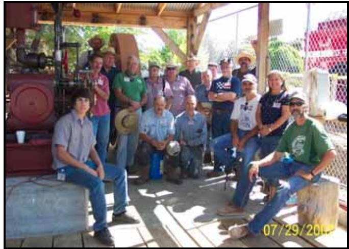
2007 sawmill crew on the last day of the fair.