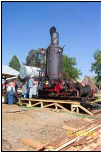
Donkey winch boiler