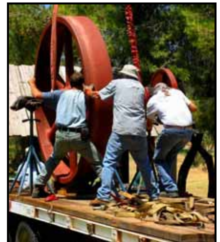
Brute force works!